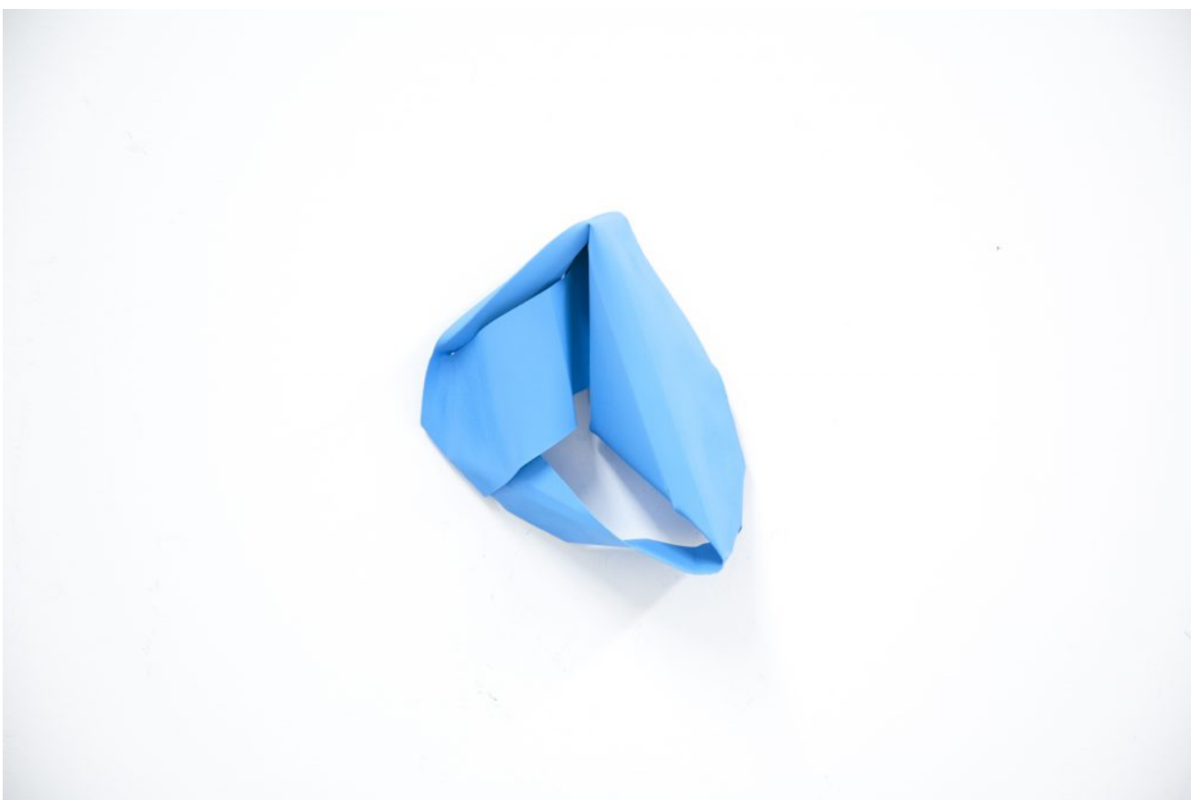
Robert Burnier, "Stano," 2016. Acrylic on aluminum 8 x 7 inches

It's been just four months since my last visit to Robert Burnier's studio at Mana Contemporary, but as I walk through the doors I am astonished at the changes. Last time, we discussed his January show at Elastic Arts, viewed the several remaining "Burnier gray" sculptures that he left out of the exhibition, and looked forward at his then-newest work: two modestly scaled but brightly colored folded aluminum sculptures. Now, large sheets of paper are taped to the walls—atop the paper, three colored sculptures rotate around each other while the flaring reds, blues and yellows of the paper background blend into each other through soft, gradual gradients. Kissing the floor and climbing up the wall, the work fills Burnier's formerly monochrome studio with fresh vibrations of chromatic energy.