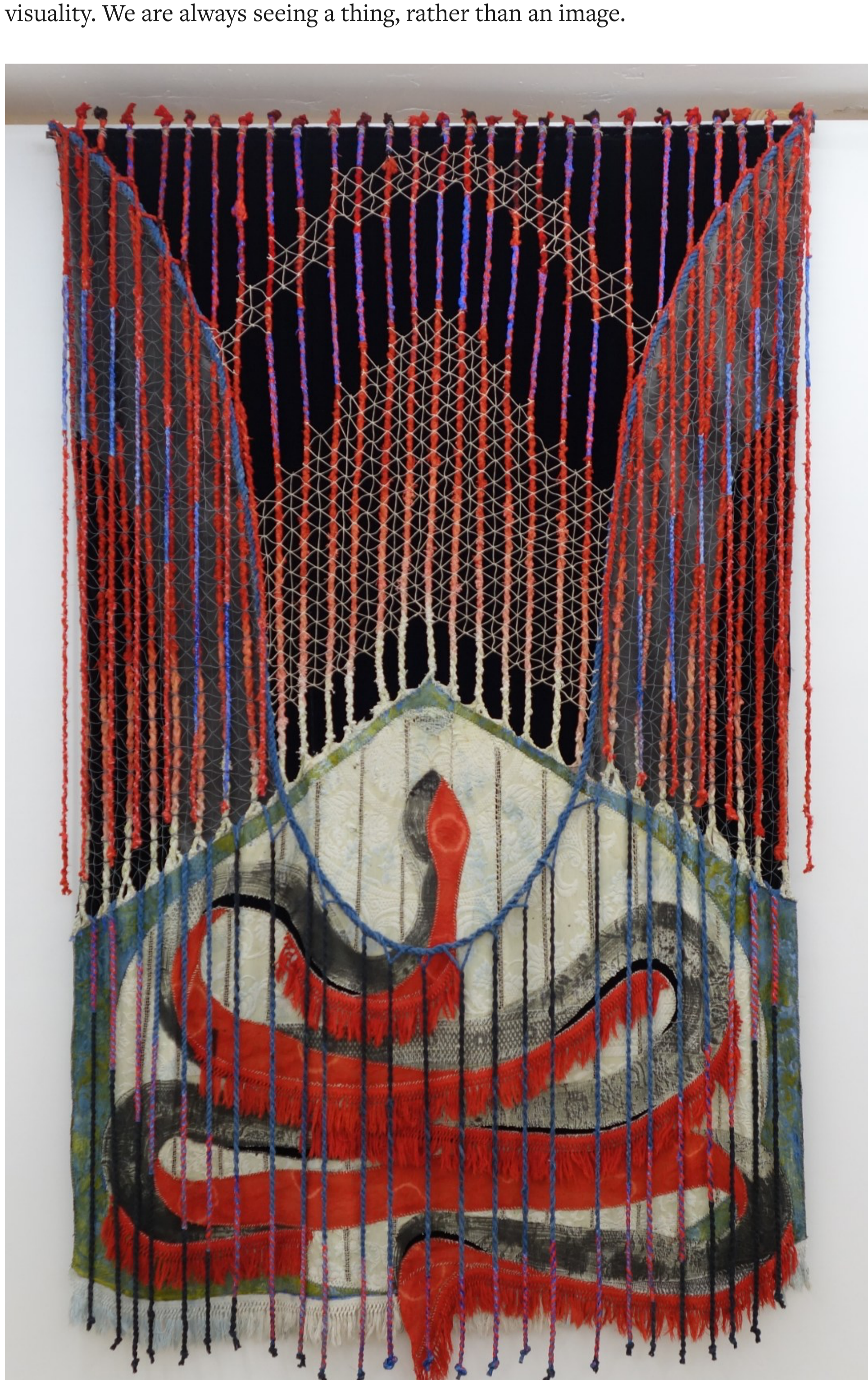
Julia Bland, "Nest" (2017), bedspread, velvet, canvas, wool, linen threads, wax, dye, ink, and oil paint, 112 x 66 inches

There are a lot of things to scrutinize in these works, from the color and surface of each section, to the different materials and processes that Bland has employed, to her pictorial synthesis of geometry and representational form. She is particular about every inch of the surface, from the weave to the color to the kinds of stitches she makes. One constant in Bland's work is the interplay between tactility and visuality. We are always seeing a thing, rather than an image.