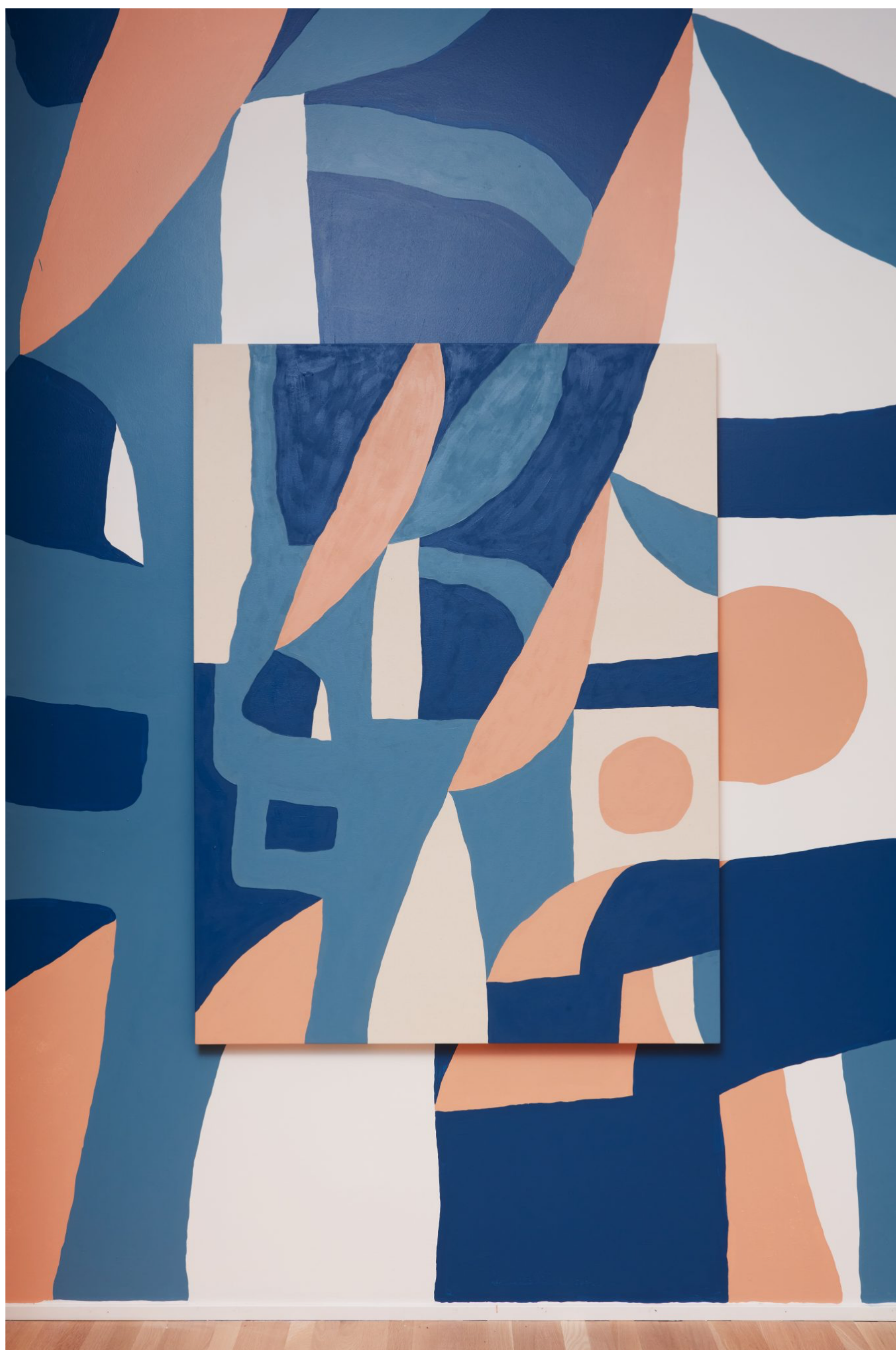
Cody Hudson, "I Have No One But You," installation view/Courtesy of the artist and Andrew Rafacz/Photo: Ian Vecchiotti

Even contours that are most sensibly read as floral can assume sinister overtones. In “They Are Looking for Something More Than This World Can Offer (Can You Drown in an Isolation Tank?),” a warm, tropical sun hovering over a cream-colored palm may just as easily be interpreted as viral proteins and cellular structures. That doesn’t mean they should be, however. Most of the pieces in the show predate the slow-motion catastrophe of the last four months.