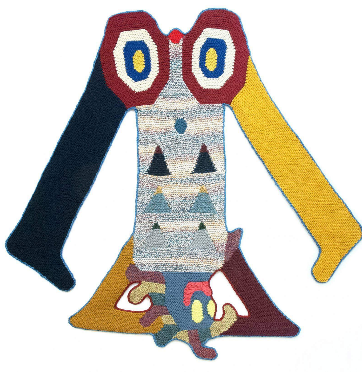
Strange Attractor for Agnes Martin, Hand crocheted assorted fibers 6' x 7' 2017

I see myself crocheting for a long time. I have endless ideas to explore the figure in that material. I'm also really into collaborative drawing which is something that I've been doing for the past two years with my friends and family. The first works of art were collaborative and made over a span of 1000's of years. When you learn how to draw well with others, you learn how to harmonize, listen, give, and compromise. I'm also bringing back sewn drawings into my practice. I think about making paintings and sculptures a lot but I need a yard and a more permanent set up if I ever decide to go down that road. I'm hopeful that my work will be really solid by the time I'm 65.