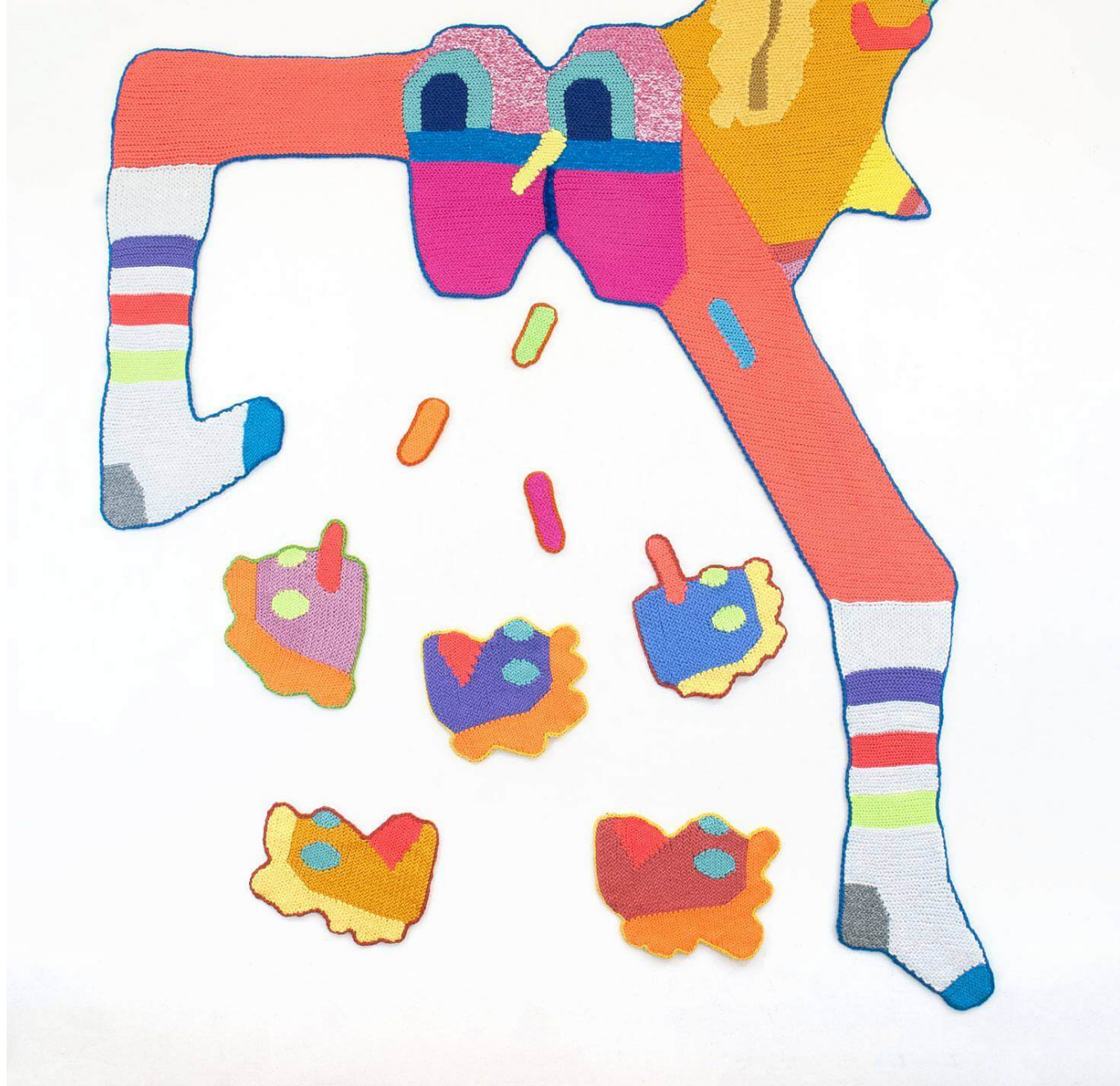
The Greatest Love of All, and crocheted assorted fibers 108" x 85" 2017

I prefer to work at home. My studio is a tiny room about 120 square feet in my 500 square foot Queens apartment. I have a comfy chair, the walls are lined with yarn, and our dining room butcher block table is also my drawing table. I have three windows. My partner is also an artist and we both have studios with doors. Our bed is in our living room.