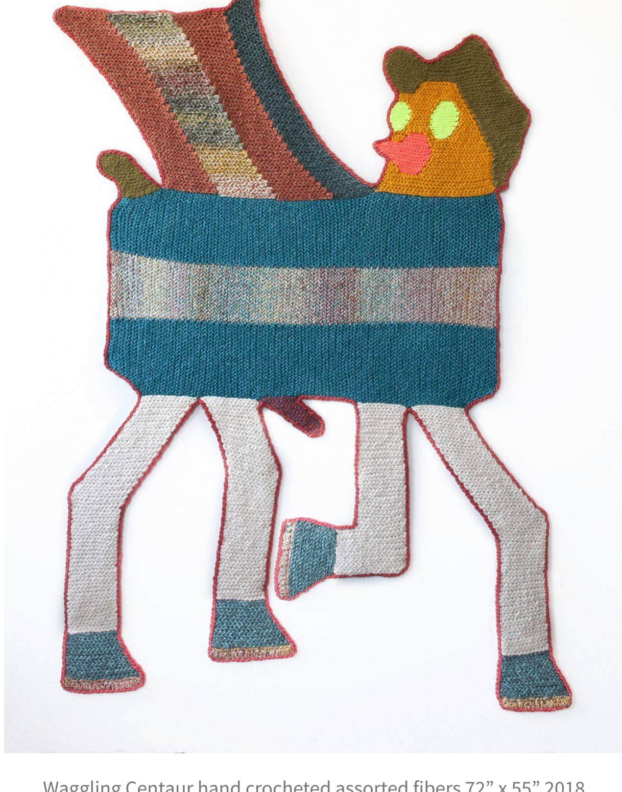
Wagging Centaur hand crocheted assorted fibers 72" x 55" 2018