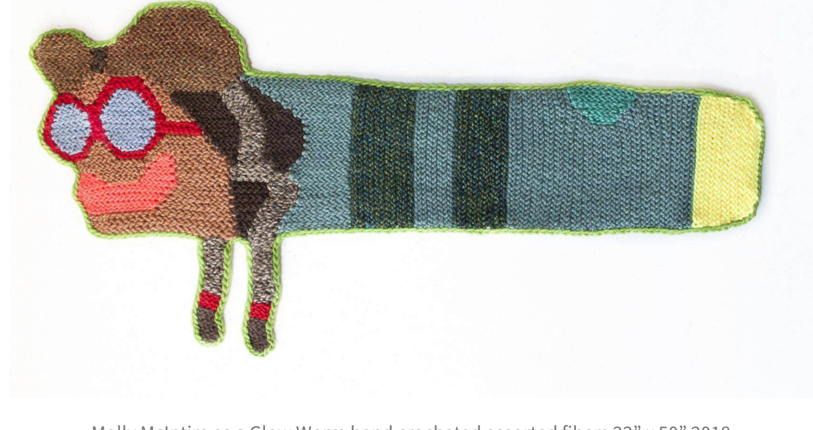
Molly McIntire as a Glow Worm hand crocheted assorted fibers 22" x 50" 2018

I also adjunct at four schools. This semester I'm teaching four classes at three different schools. Eventually I hope to have a full-time tenure track position at a public college. Teaching is just as important to me as making art. I find it to be more fulfilling than every faucet in our field except for having time and resources to make work. Being able to help a young artist get closer to what they want to do is really fulfilling. It has a deeper intrinsic value than a flashy show or high profile review. The high of both of those things only lasts about two days. To have a positive impact on the development of someone's work when they need help the most is much more meaningful to me.